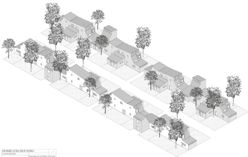
HOMELESS HOUSING ANONYMOUS 1:250 2021