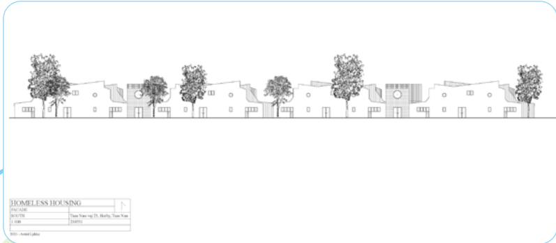
HOMELESS HOUSING ANONYMOUS 1:250 2021